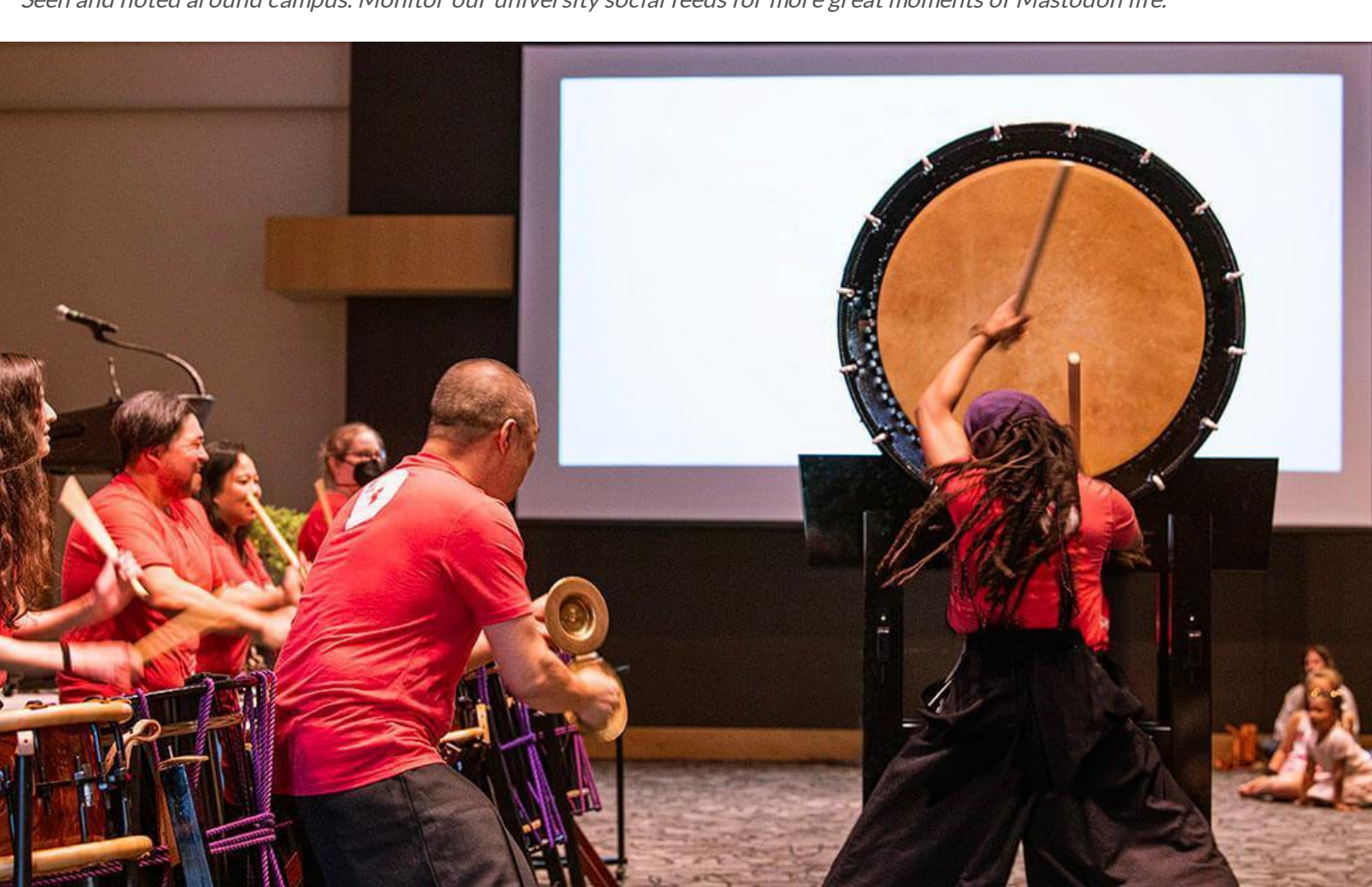
The annual Cherry Blossom Festival, celebrating Japanese culture, moved this year from downtown Fort Wayne to the PFW campus. Taiko drumming—always a big "hit"—filled Walb Student Union on Sunday with traditional sights and sounds.

Seen and noted around campus. Monitor our university social feeds for more great moments of Mastodon life.